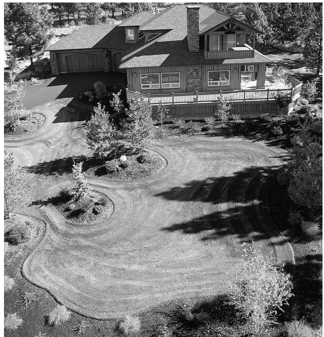
FIGURE A.4.2.5.2(b) Small Planting Islands Within an Expanse of Maintained Lawn.

N A.5.2.1(1) Examples of such materials include steel, concrete, masonry, and glass.