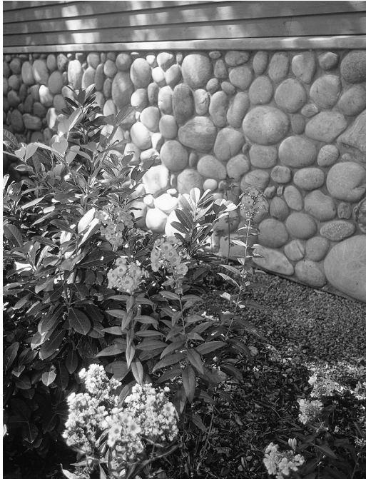
FIGURE A.4.2.4.1(a) Foundation Planting and Landscaping.