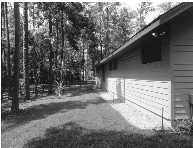
FIGURE A.4.2.2.5 Mitigating Risk of Leaf- and Needle-Filled Gutters.

Hanging ½ in. (12.5 mm) or thicker drywall on the exterior wall studs prior to adding stucco, siding, and so forth can increase the fire rating.