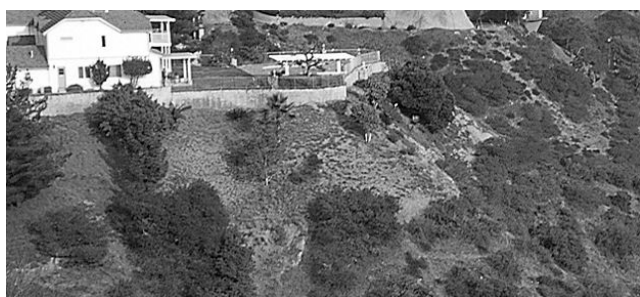
FIGURE A.5.1.3.3(a) Noncombustible Barrier on the Edge of a Downslope.