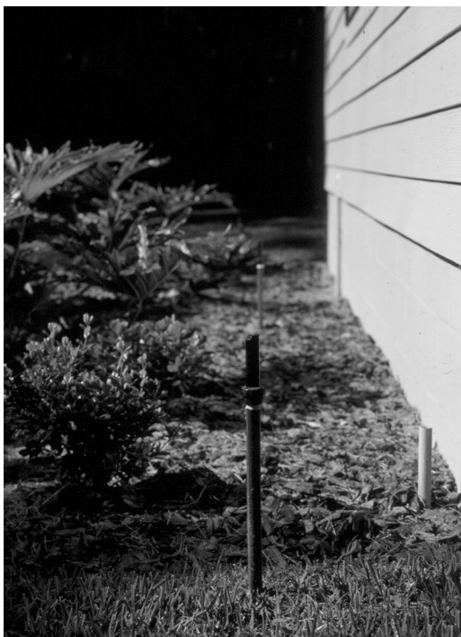
FIGURE A.4.2.4.1(b) Use of Low Volume Sprinklers in Organic Material.

A.4.2.4.5 Parking vehicles on areas of dry grasses and fine fuels could result in ignition by hot exhaust systems or fire-brands. Also, a fire that originates from a parked vehicle could present an exposure hazard to the primary structure or nearby vegetation. Any dry vegetation beneath the vehicle could cause ignition of the vehicle, which in turn could cause structure ignition; conversely, the ignition of the structure could cause ignition of the vehicle, which could present additional dangers to responding fire fighters.