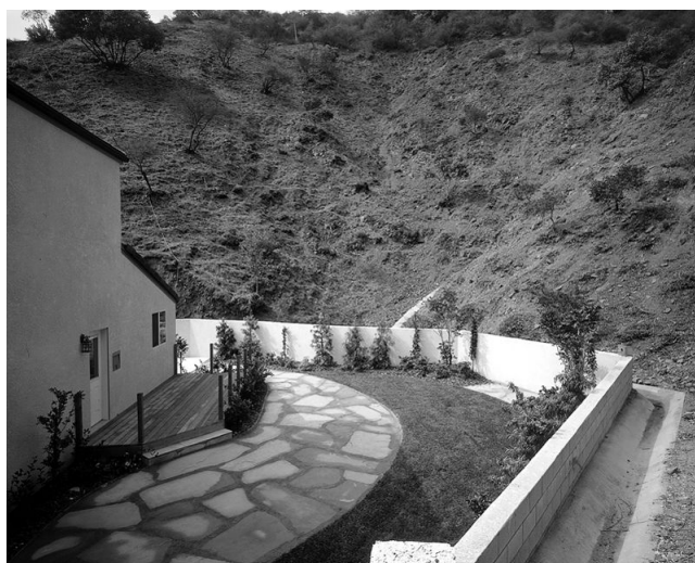
FIGURE A.5.1.3.3(b) Noncombustible Barrier Behind a House on the Edge of the Upslope.

The following descriptions of the expected performance of roofs meeting those classifications is based on ASTM E108, Standard Test Methods for Fire Tests of Roof Coverings :