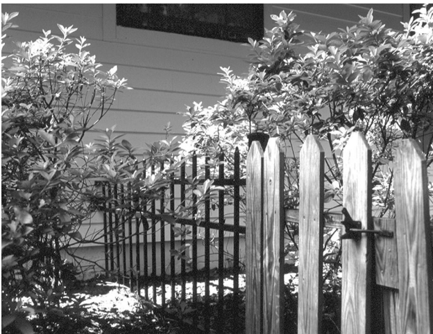
FIGURE A.4.2.4.3(b) Transition Fence Separates Combustible Fence from Structure.

Δ A.5.1.3.5 For more information, see NFPA 241. Acceptable methods of fuel treatment include, but are not limited to, prescribed burning by qualified personnel, mowing, pruning, removing, substitution, mulching, converting to compost, and grazing.