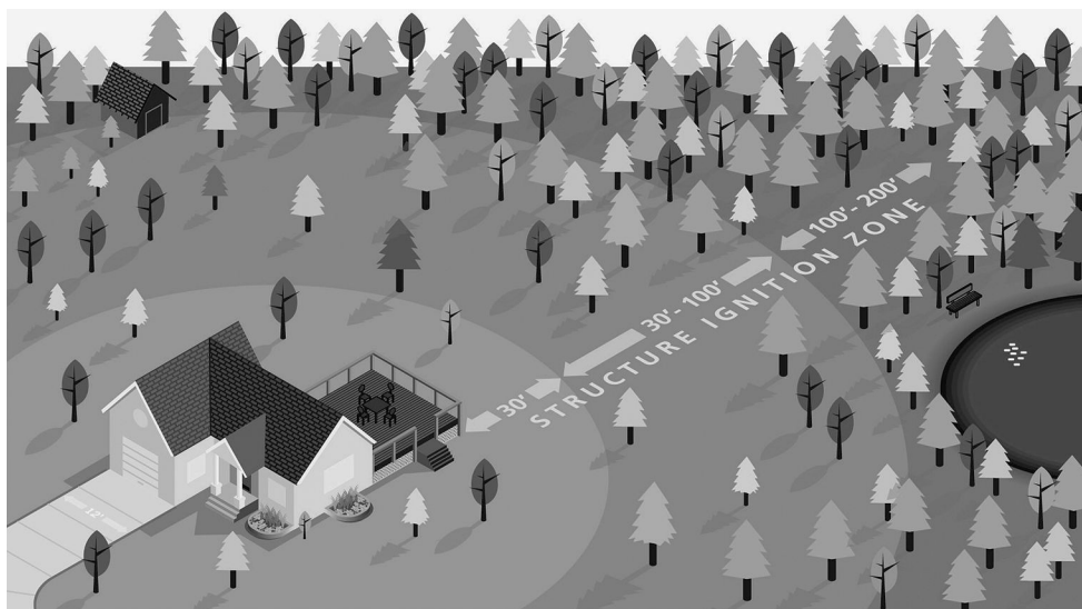
FIGURE A.4.2.4 The Structure Ignition Zone.

A.4.2.4.4 Examples of such structures include, but are not limited to, hot tubs, utility sheds, outbuildings, detached garages and carports, gazebos, trellises, auxiliary structures, stables, barns and other structures within 30 ft (9 m) of the primary structure, outdoor furniture, and recreational structures (e.g., children's playhouses, swing sets). In some cases, separation distances from lot lines might require the inclusion of neighboring residential structures in the assessment.