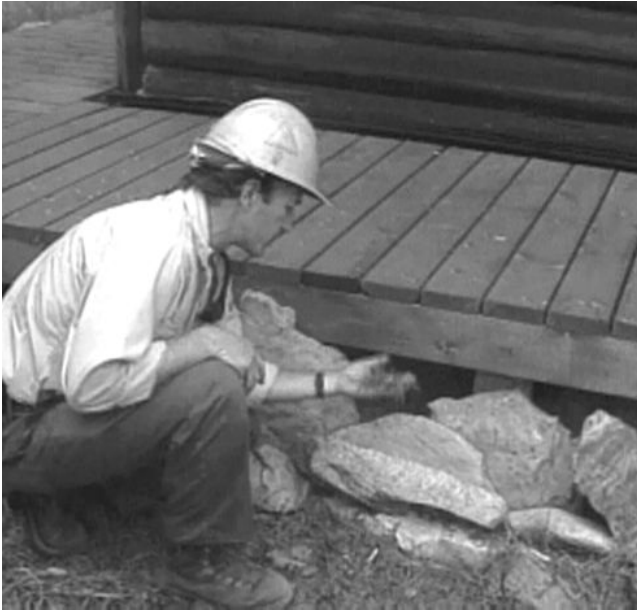
FIGURE A.4.2.4.3(a) Leaf Litter and Needles Collect in Small Spaces.