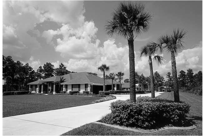
FIGURE A.4.2.5.2(a) Planting Islands Offer Exposure Protection, Preserve Aesthetics.

N A.5.2.1 The provisions of 5.2.1 do not require inherently noncombustible materials to be tested in order to be classified as noncombustible materials.