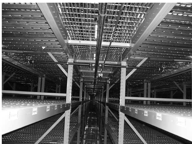
FIGURE A.4.9.1 A Typical Rack Layout for Carton Records Storage.

Figure A.4.9.1 illustrates a typical rack layout for carton records storage showing the design and installation of in-rack sprinklers underneath the catwalks and in the transverse flues.