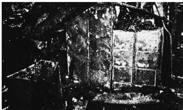
FIGURE A.10.3.1(b) Records in the Nonrated Equipment at the Left Were Destroyed.