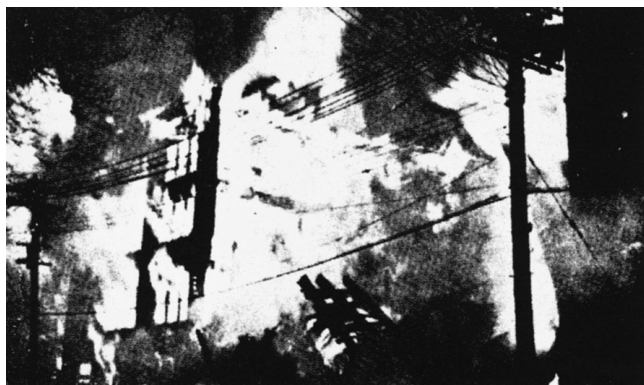
FIGURE A.6.10.1(a) A Hardware Factory Fire in Syracuse, NY, That Involved a Two-Story Vault.

A.6.10.4 Interior emergency lighting could be necessary.